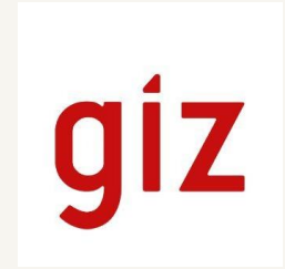
GIZ Connectivity + Secretariat