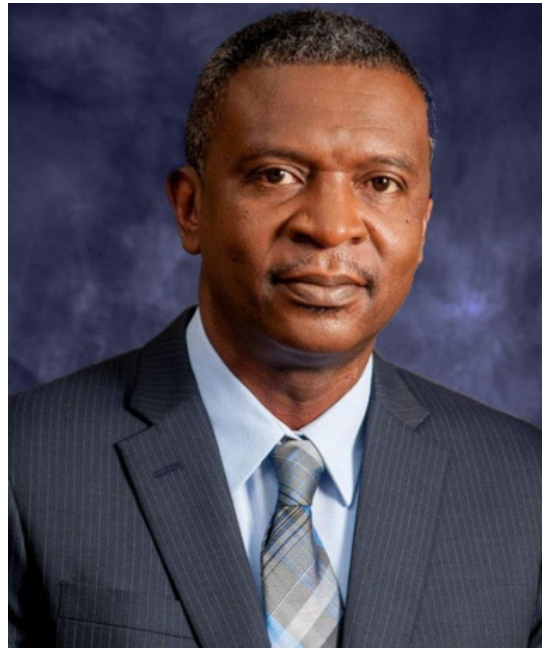
Sen. the Hon. Hassel Bacchus CTU President and Minister of Digital Transformation, Trinidad and Tobago