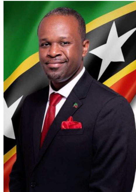
Hon. Konris Maynard Minister of Public Infrastructure, Energy and Utilities, Domestic Transport, Information, Communications and Technology and Posts, St. Kitts and Nevis