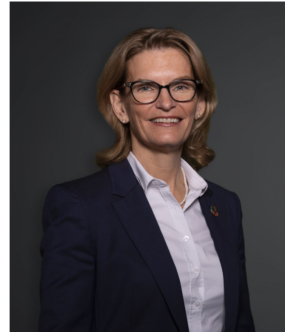
Doreen Bogdan- Martin Secretary-General ITU