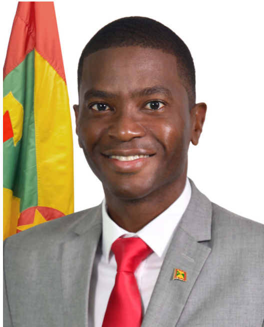
Hon. Dickon Mitchell Prime Minister of Grenada and Lead Head for Science and Technology